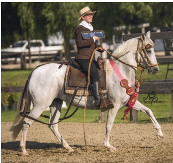
DJG Mirasol Pacific Coast Championship Laureada Amateur Performance Mare (2018, 2019, 2024)