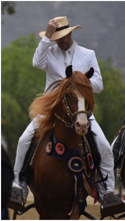
BBG Vegas Grand Championship Laureado AOTR Performance Horse (2024, 2022, 2021)