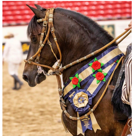
WF Capuchino Pacific Coast Championship Laureado Amateur Performance Gelding (2021, 2022, 2024)